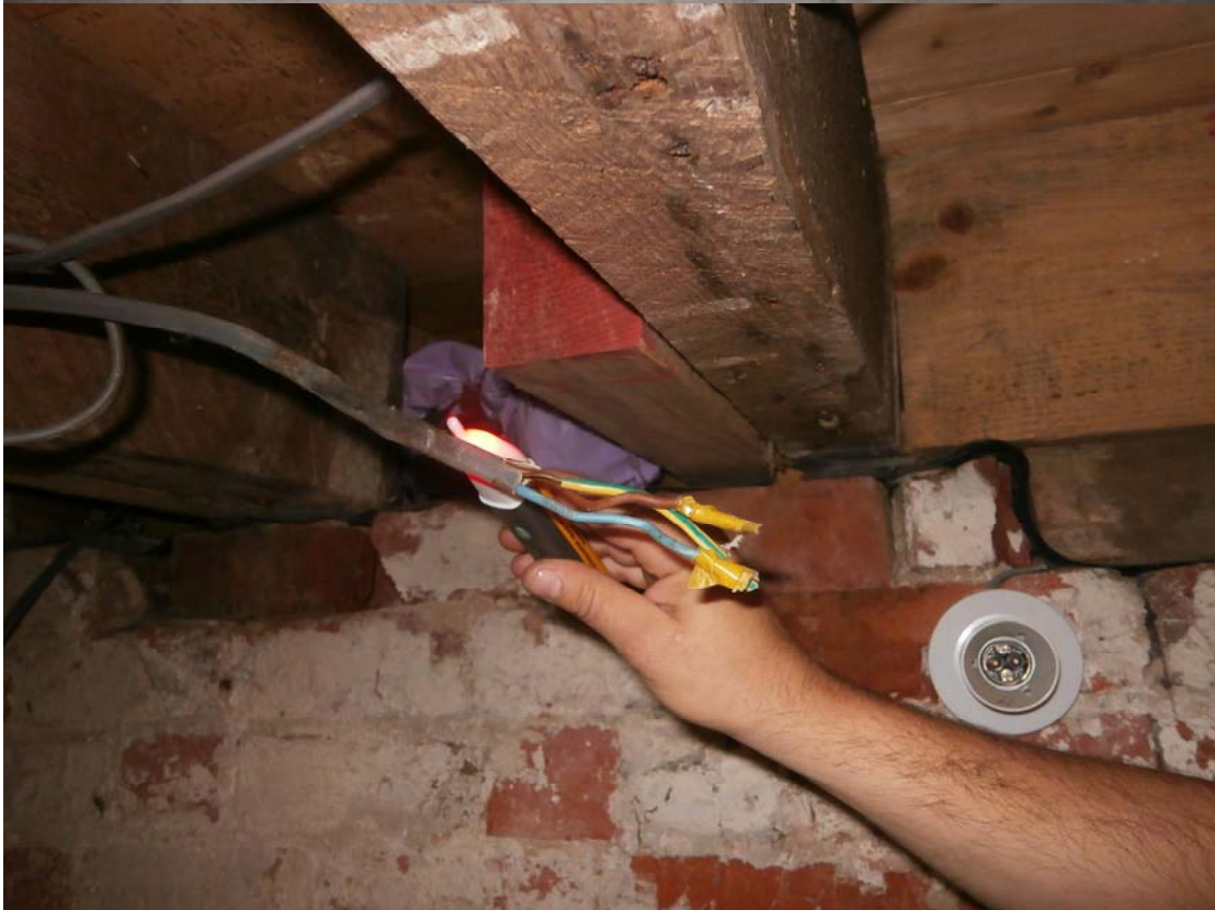
14) A prohibition notice was served on the electrical installation until proven as safe.